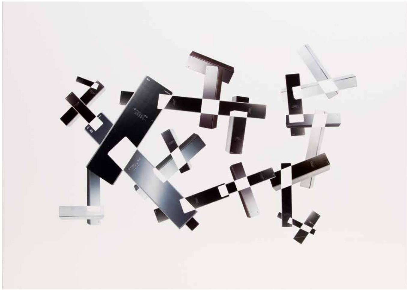
Hardware Store Collages—LG and Samsung Self-Cleaning Closets, and Samsung Window #1; 2019; Clippings from electronics sales brochures on chromolux paper, mounted on alu-dibond, framed, two parts, 51.2 x 71.2 cm each.