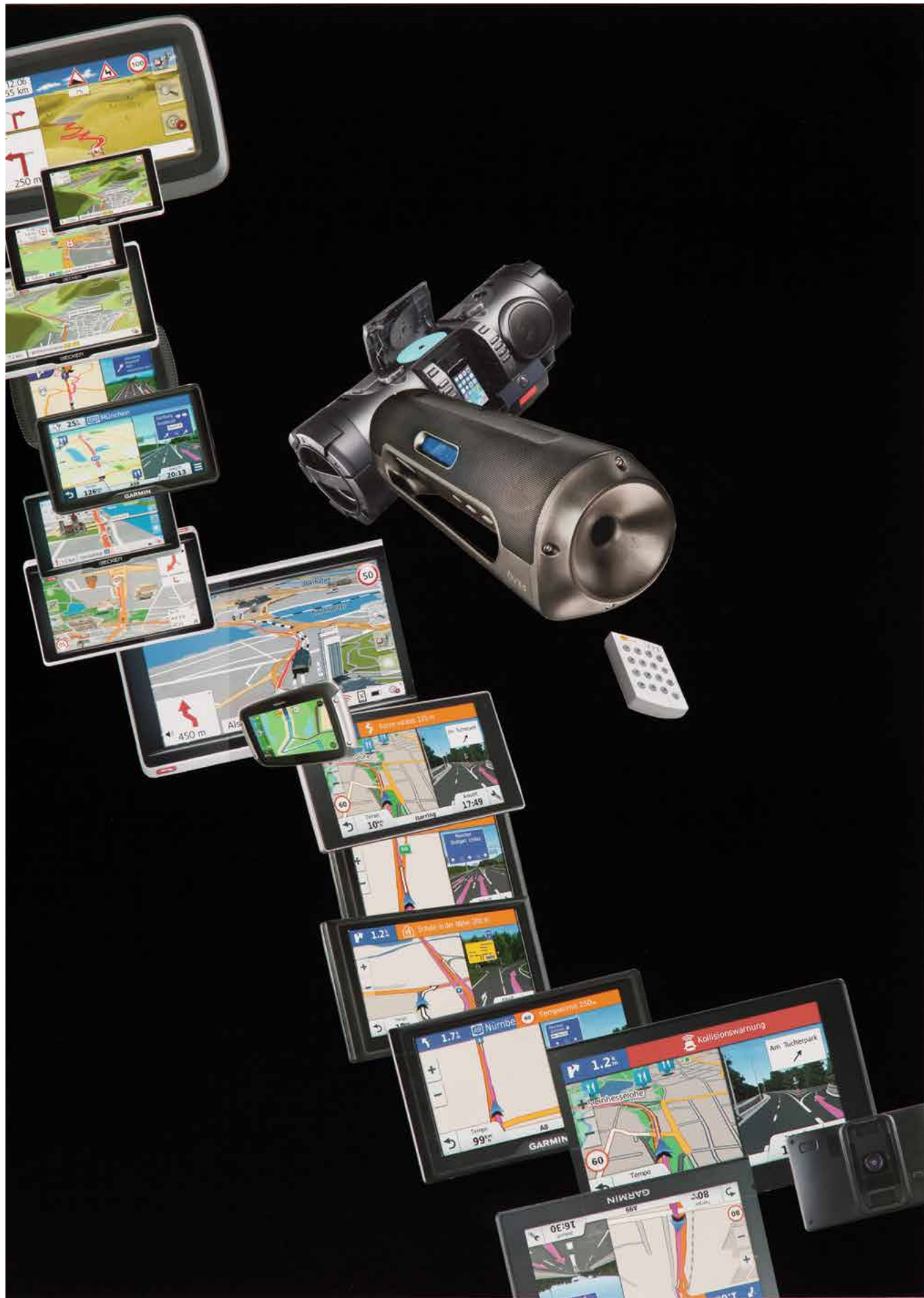
Hardware Store Collage—Saturn Navigation Devices, Boomboxes, and Remote Control #1; 2017; Clippings from electronics market catalogs on chromolux paper, mounted on alu-dibond, framed; 71.2 x 51.2 cm.