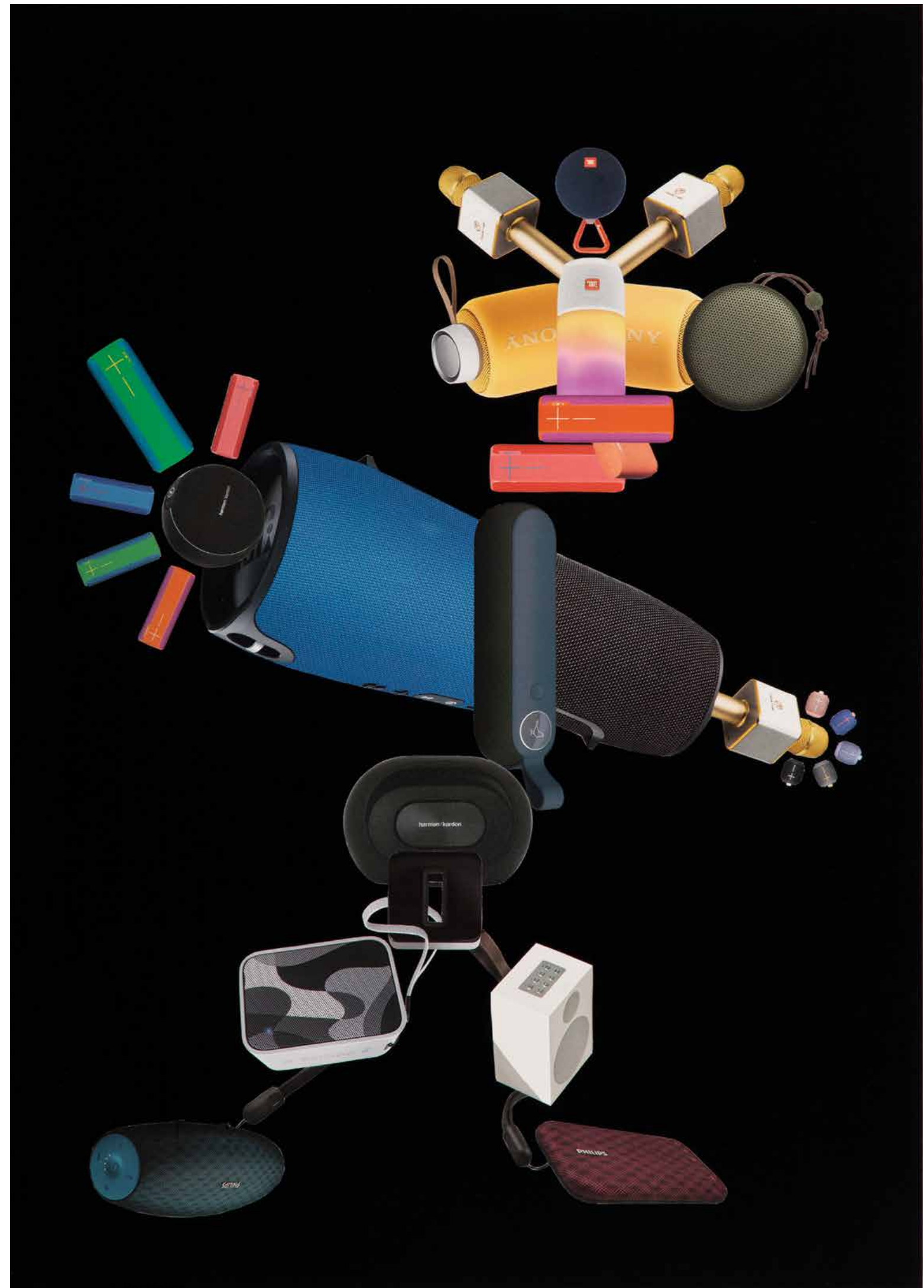
Hardware Store Collage—Saturn Bluetooth Speakers and Wireless Microphones #1; 2017; Clippings from electronics market catalogs on chromalux paper, mounted on alu-dibond, framed; 71.2 x 51.2 cm.

Haegue Yang: Handles can be seen at MoMA, New York, October 21, 2019–spring 2020. Haegue Yang: In the Cone of Uncertainty will be on display at The Bass Museum of Art, Miami Beach, November 2, 2019–April 5, 2020. X