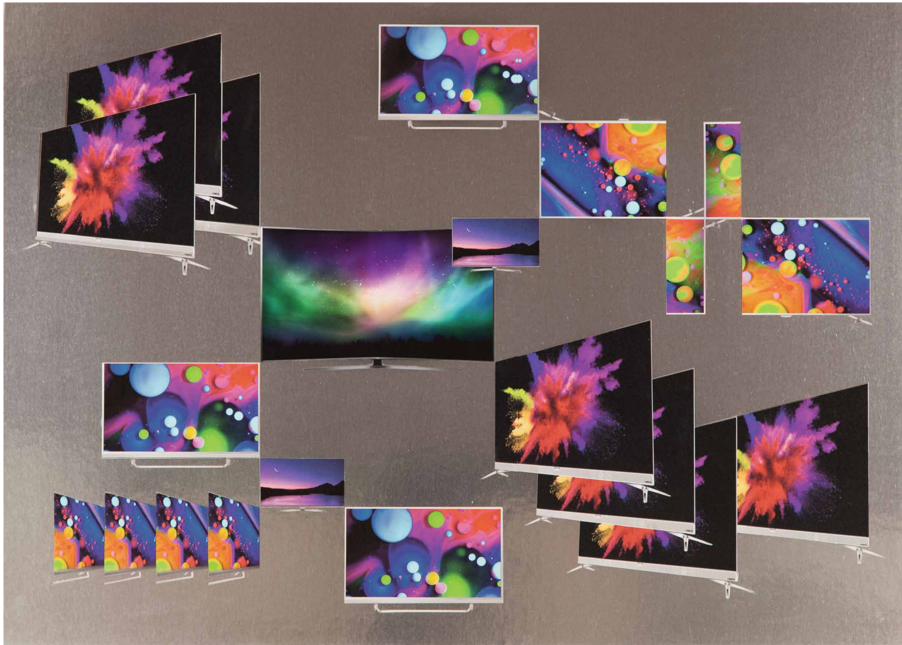
Hardware Store Collage—Saturn LED and OLED TVs #1; 2017; Clippings from electronics market catalogs on chromolux paper, mounted on alu-dibond, framed; 51.2 x 71.2 cm.