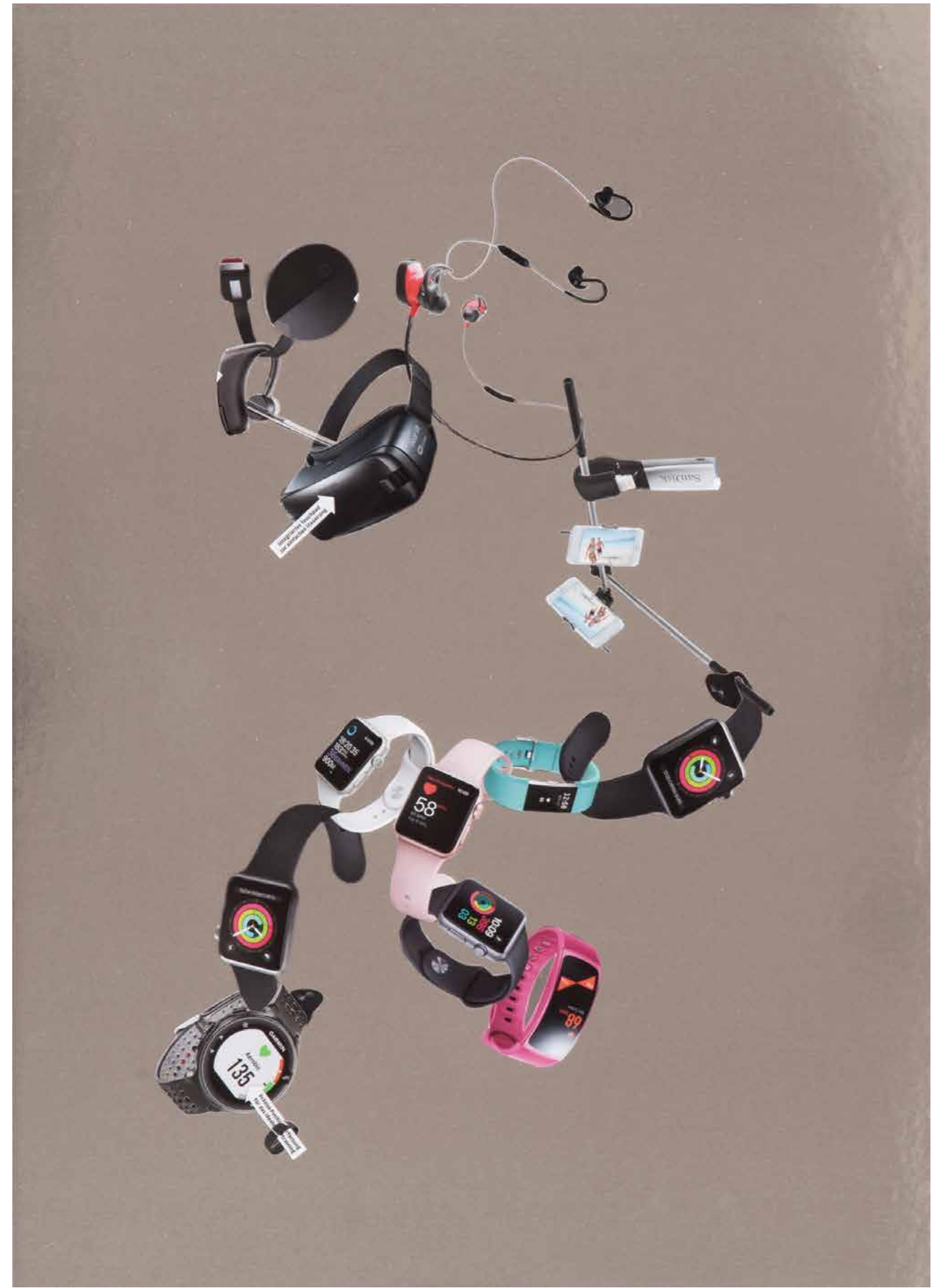
Hardware Store Collage—Media Markt Electronic Devices and Gadgets #1; 2017; Clippings from electronics market catalogs on chromolux paper, mounted on alu-dibond, framed; 71.2 x 51.2 cm.